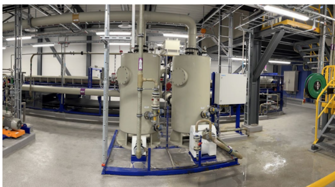
ReZinc Ash Leaching Plant in Sweden

Our solutions require minimal maintenance, offer substantial financial benefits, and support eco-friendly operations by reducing CO 2 emissions.