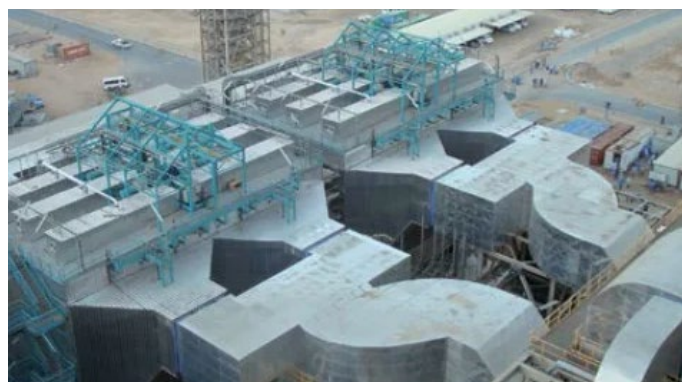
Electrostatic Precipitator in Saudi Arabia

The ADIOX® dioxin removal process is based on the high affinity of dioxins to carbon. By dispersing small particles of carbon in PP-plastics, a material excellent for dioxin abatement is produced. A dioxin molecule that is present in the flue gas is initially absorbed into the PP and then migrating to a carbon particle where it is strongly adsorbed (connected to its surface). The plastic material acts as a selective membrane with a preference for molecules like dioxins. When the service life of the ADIOX material has come to an end, the material is incinerated. The dioxins are destroyed during the incineration process and removed from the ecocycle. Tower packings and droplet separators, produced of ADIOX material, can be installed in wet, saturated and dry applications.