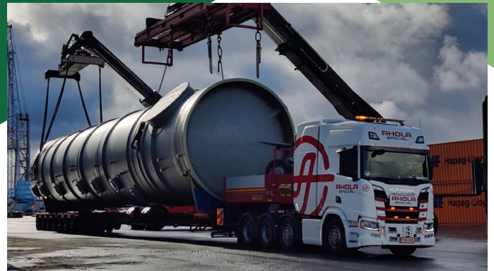
Scrubber in Finland