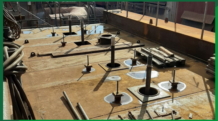
Electrostatic Precipitator in Germany