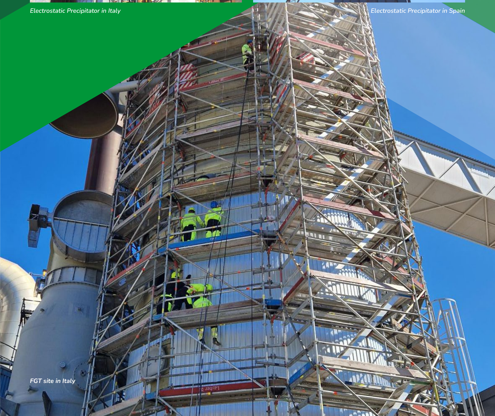
FGT site in Italy