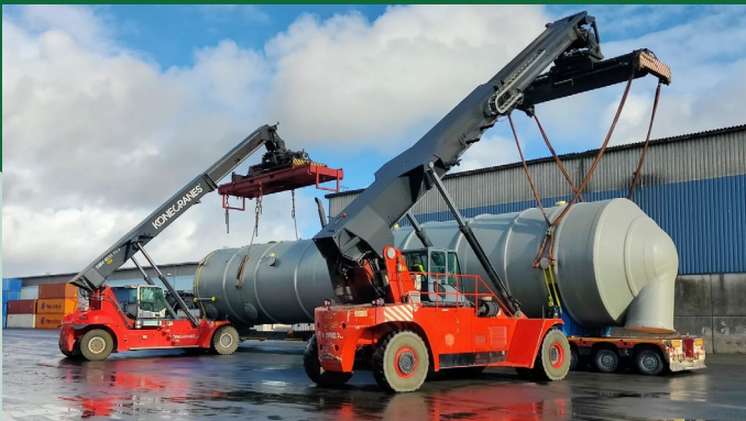
Scrubber in Finland

Incineration plants convert flue gas energy into steam through boiler systems, producing electricity and district heating. Our condensing scrubber technology captures excess heat, transferring it into district heating or other systems. Maximize your energy system's efficiency with our condensing scrubber technology and reduce environmental impact, resulting in a sustainable, economical heating solution.