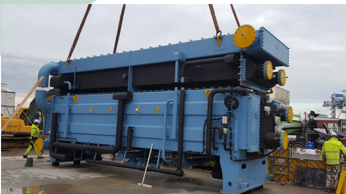
Absorption Chiller in Sweden