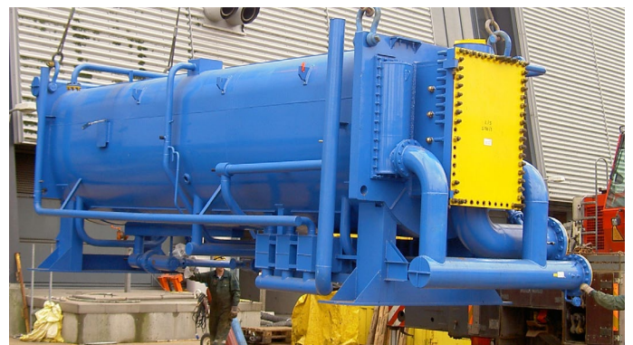
Absorption Chiller in Sweden