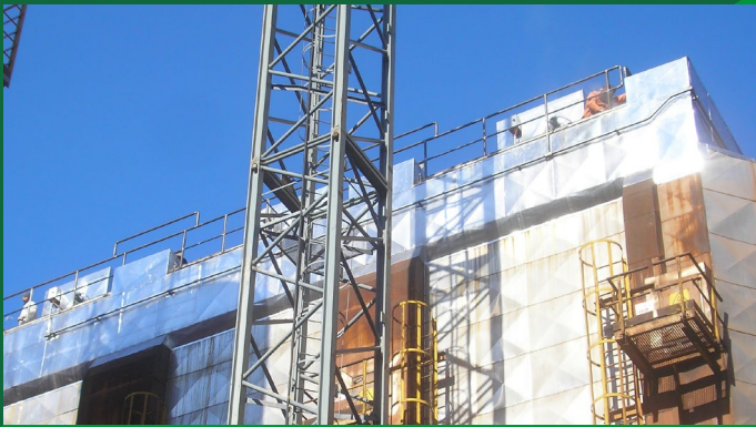
Electrostatic Precipitator in Italy